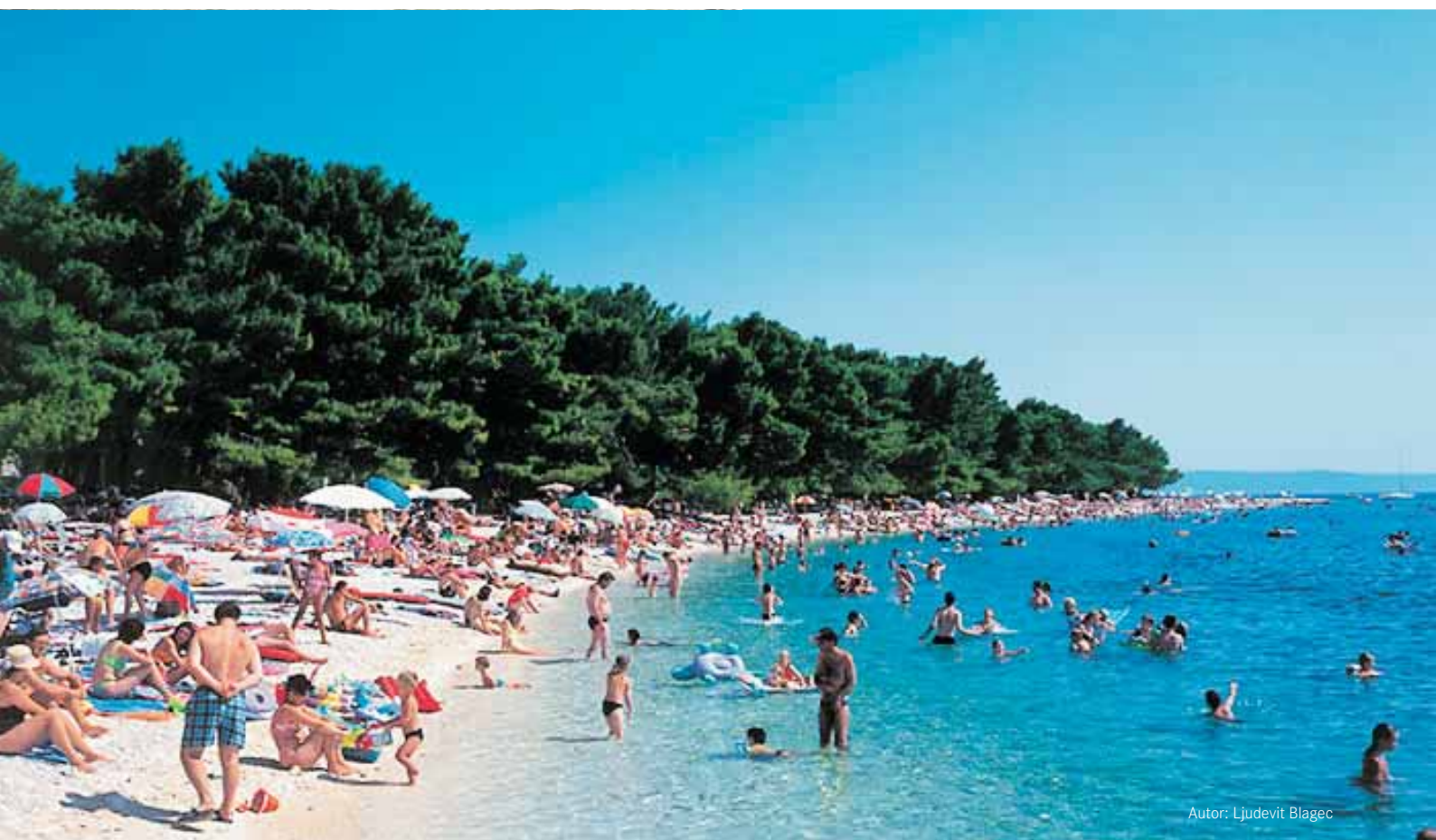
Autor: Ljudevit Blagec

the church of St. Nicholas was built in 1889. At the beginning of the 20 th century, when the quay was built, Baska Voda became the most significant port in the area, and in mid-20 th ct. tourism started to develop, which also led to the building of hotels.