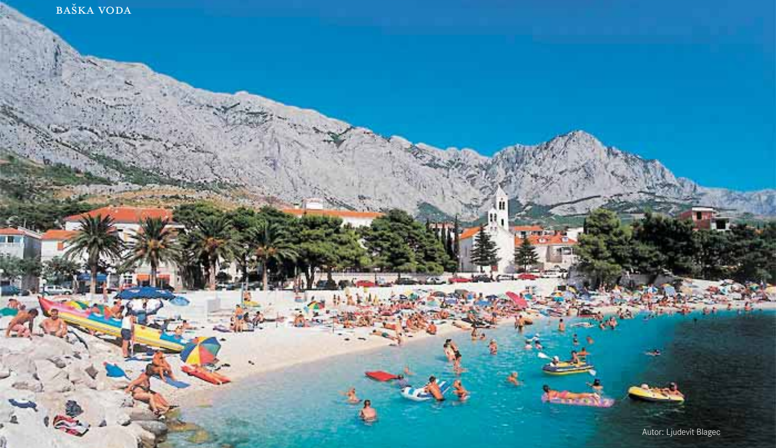
Autor: Ljudevit Blagec