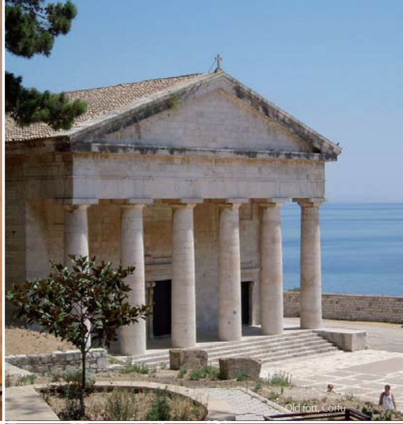
Old fort, Corfu