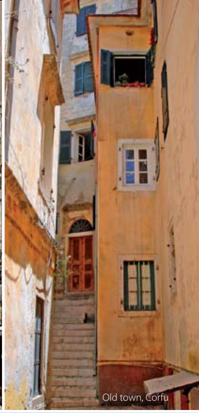
Old town, Corfu