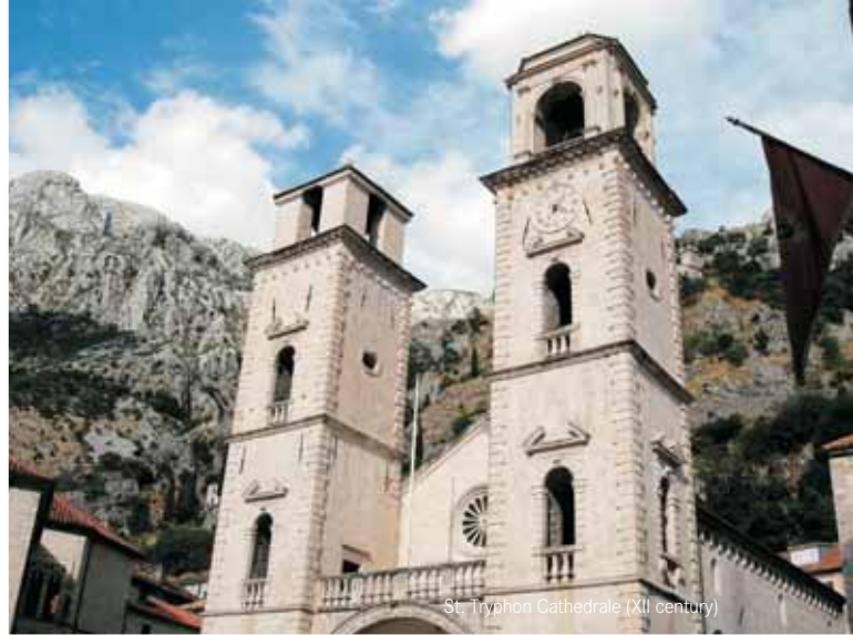
St. Tryphon Cathedrale (XII century)