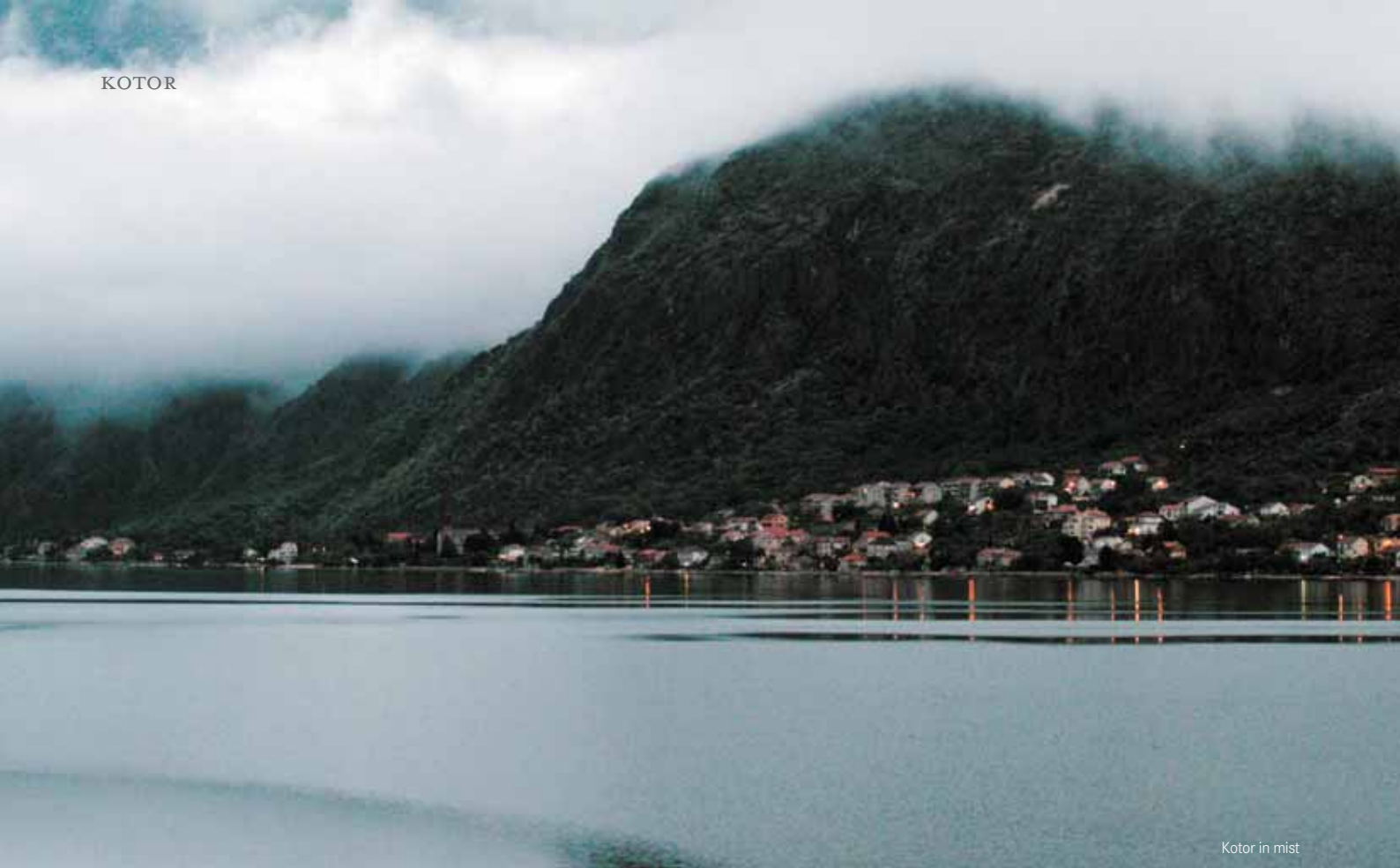
Kotor in mist