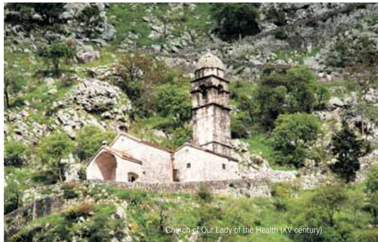
Church of Our Lady of the Health (XV century)

Cultural sights of the town, which are preserved until today, are the following: the Cathedral of St. Tryphon (12 th ct.), the Romanesque church of St. Anne from the end of the 12 th ct. with the frescoes from 15 th ct., the Romanesque church of St. Luke (12 th ct.), the Romanesque church of St. Mary (13 th ct.), the Gothic church of St. Michael, the church of Our Lady of the Health (15 th ct.), Duke's palace (17 th ct.), Napoleon's theatre (19 th ct.), and the orthodox church of St. Nicholas from the beginning of the 20 th century with the rich collection of icons.