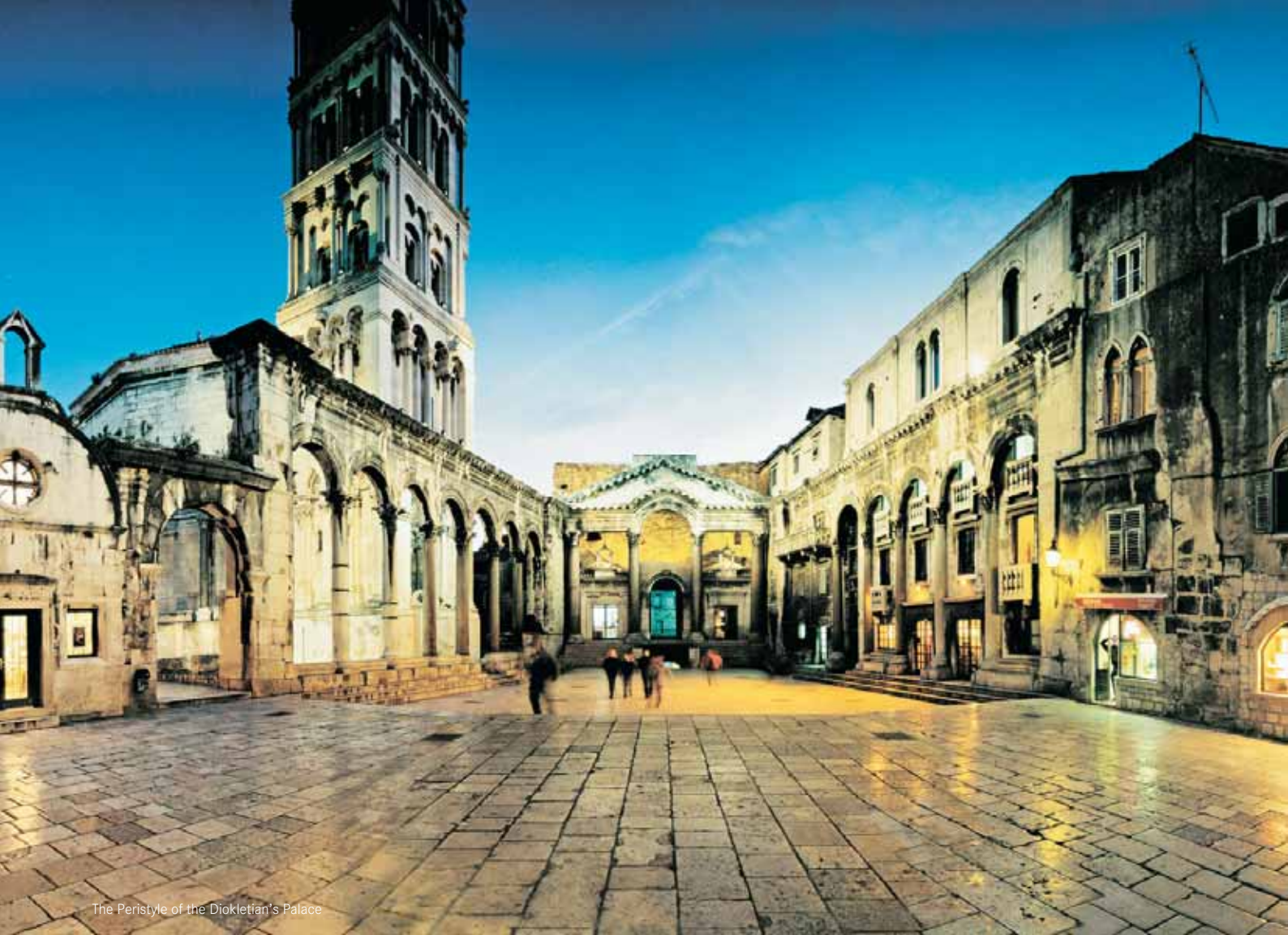
The Peristyle of the Diocletian's Palace